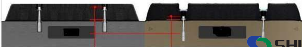
Normal Car Stopper

It resists vehicle's impact since Car Stopper Screw is fixed deeply on the ground.